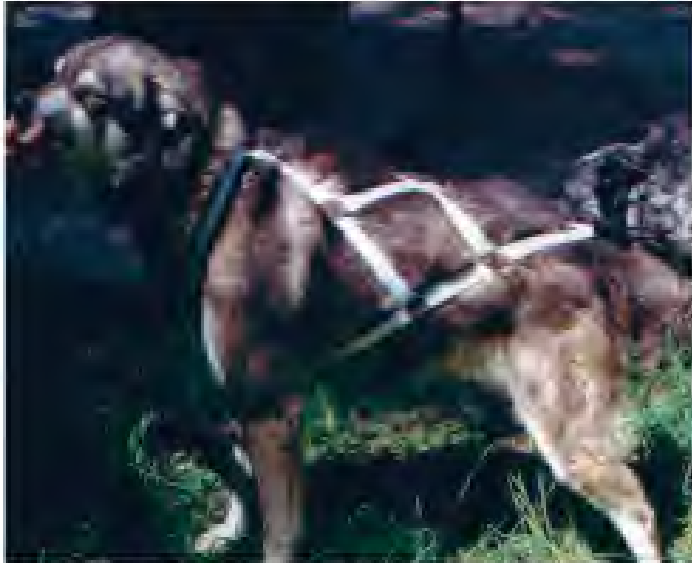
(Piper being properly fit for x-back harness)