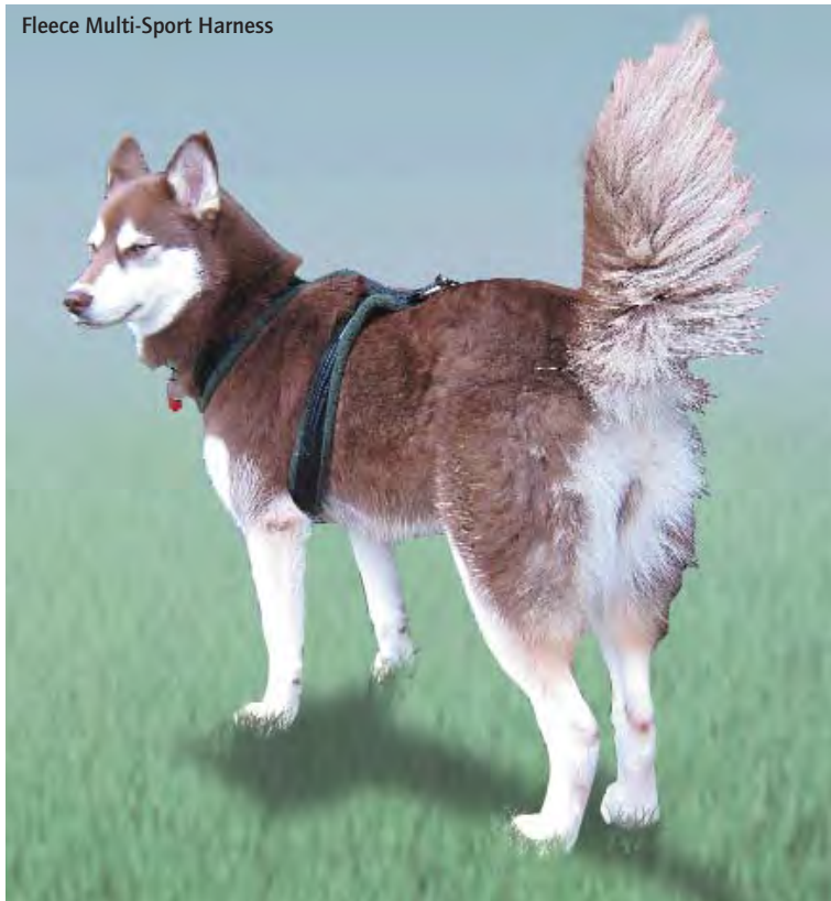
Fleece Multi-Sport Harness

LARGE EXTRA LONG (LXL) for longer bodied rangey dogs 55-60 lbs